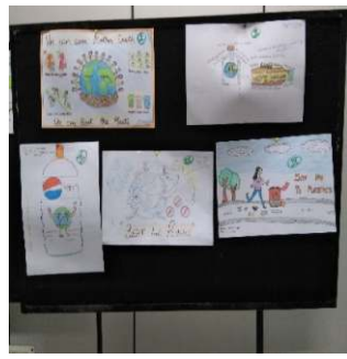
Managing organic wastes