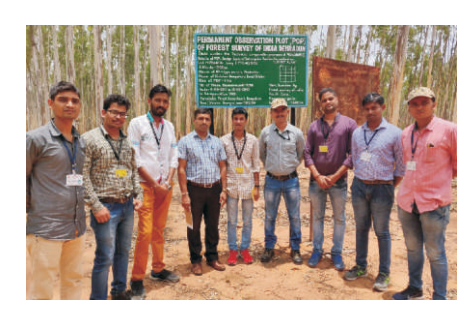
Eastern Zone, Kolkata