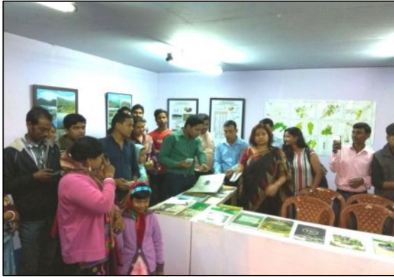
13 th Jatiya Sanhati Utsav-O-Bharat Mela

Forest Survey of India, Eastern Zone, Kolkata participated in 13 th Jatiya Sanhati Utsav-O-Bharat Mela from 14 th December to 18 th December, 2017 and Sundarban Kristi Mela-O-Loko Sanskriti Utsab from 20 th to 29 th December, 2017, with other Central Government Organizations & PSU of Govt.