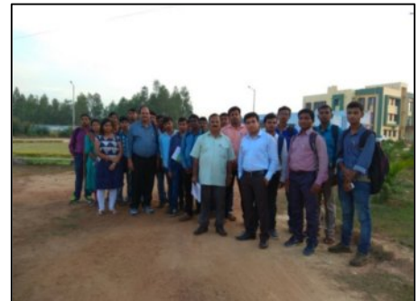
Training under JICA to the SFD's officials at Kharagpur