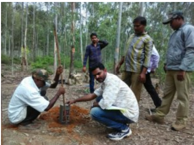
Demarcation of POP

Permanent observation plots (1 circular and 1 square) have been laid out at Kolar Forest Division of Karnataka on Pilot basis during this period.