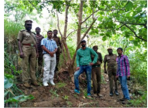
Field Inspection Team at Tamilnadu

Inspection of ongoing Forest Inventory work in various states has been carried out by Regional Director and Sr. Deputy Director from time to time.