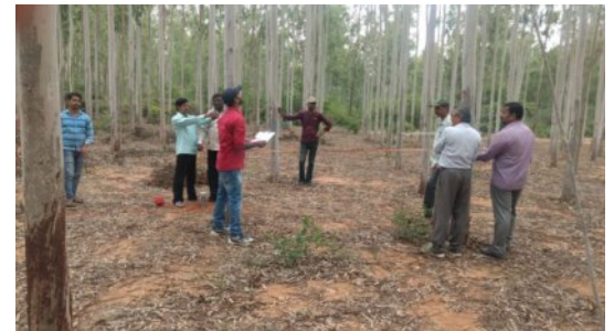
Enumeration inside POP