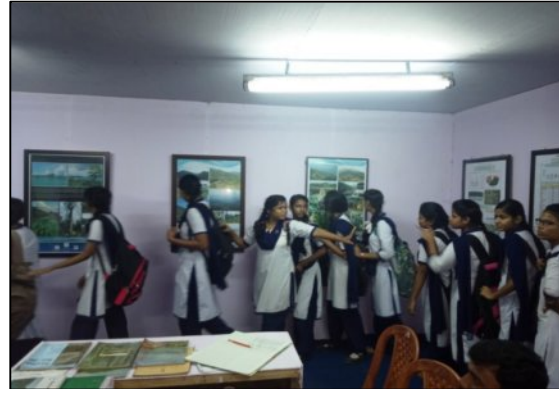
Sundarban Kristi Mela-O-Loko Sanskriti Utsab